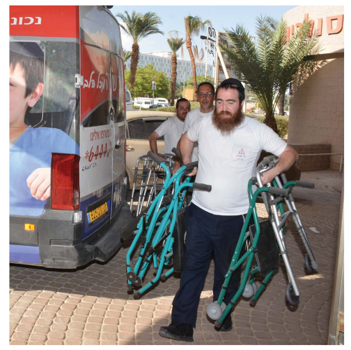
Volunteers bring medical equipment to those in need.

For those who have remained or returned to Ashkelon, volunteers with Yad Sarah have helped repair and reconfigure fortified rooms to ensure they meet accessibility and operational standards.