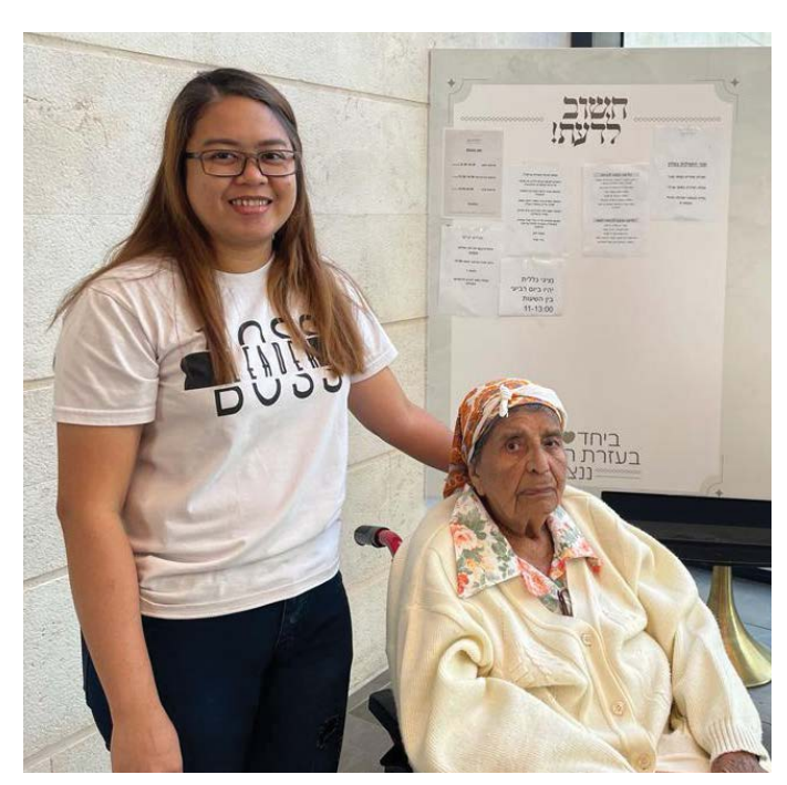
Individuals who have evacuated to the Yirmiyahu33 hotel in Jerusalem.

Yad Sarah is proud to continue providing compassionate care to the people of Israel during times of war and peace. This work is more important than ever, as Israel recovers and rebuilds from one of the darkest days in modern Jewish history. With several newly opened branches and tireless efforts by its growing network of volunteers, Yad Sarah is stepping up to meet the moment and provide rays of hope for Israelis who need it most.