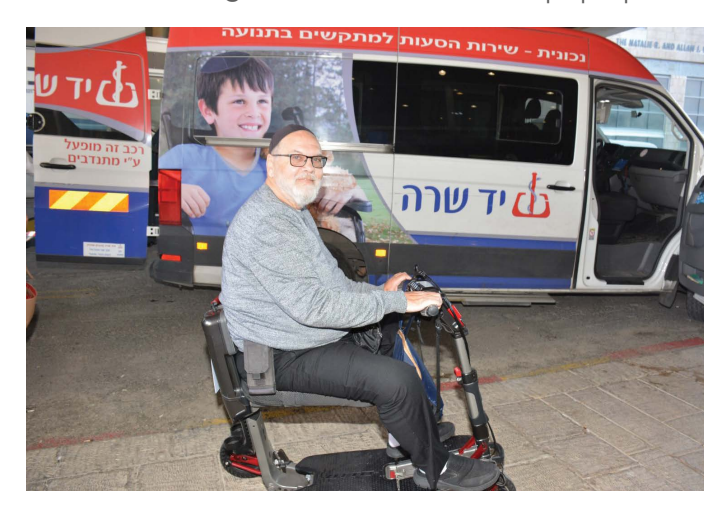
A client utilizes Yad Sarah's Wheelchair Accessible Van.

Many individuals had to leave their vehicles behind when evacuating, so volunteers at these pop-up