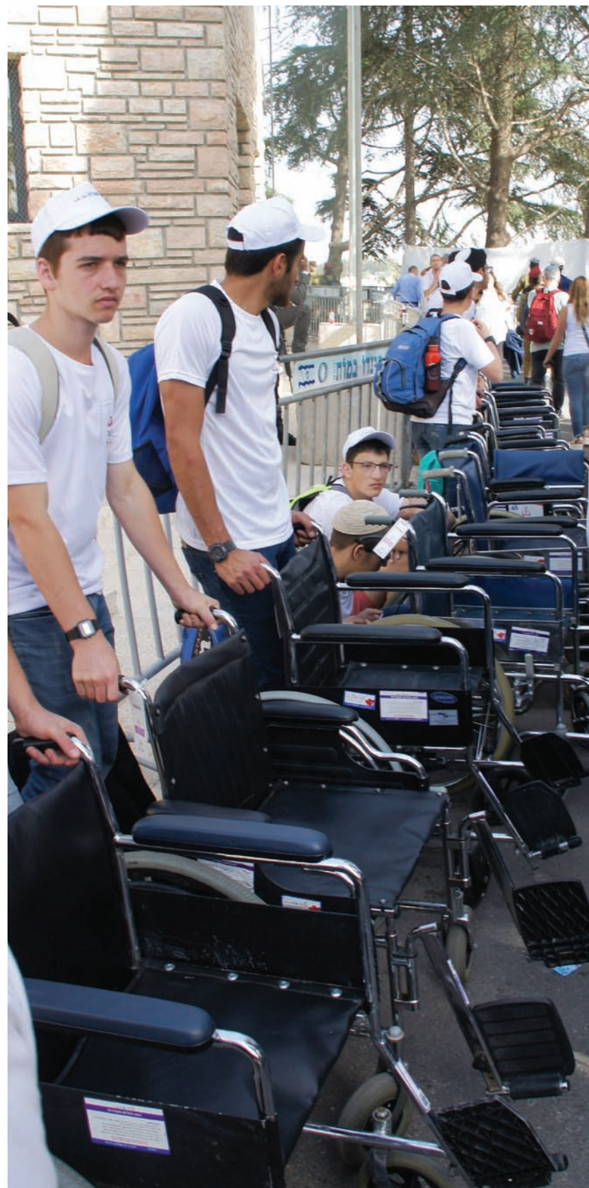
Ready and waiting to help