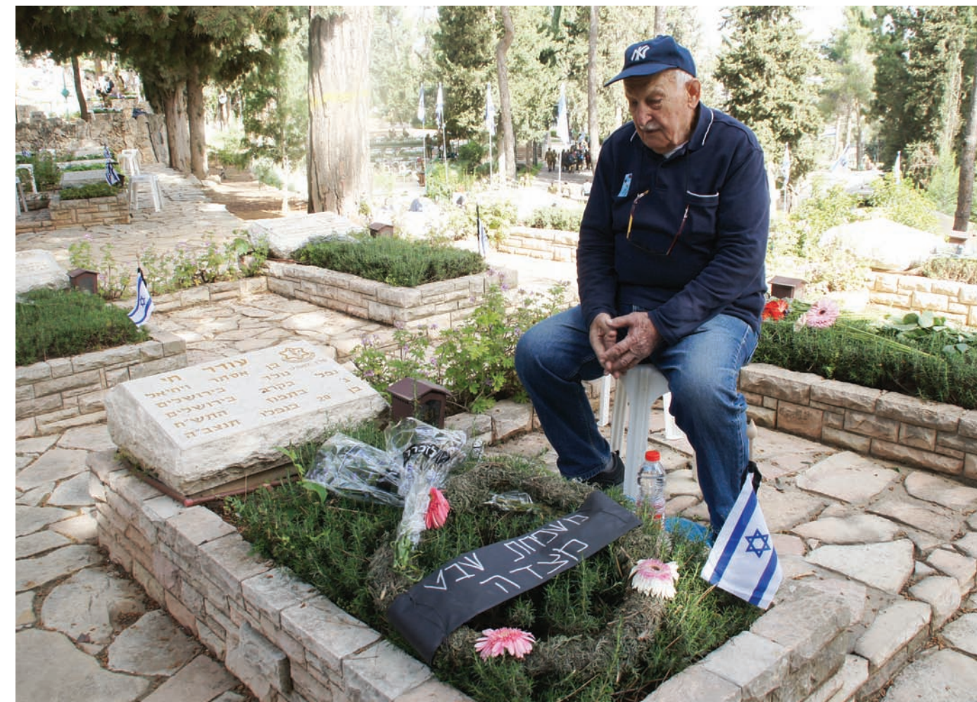
Paying tribute to fallen heroes